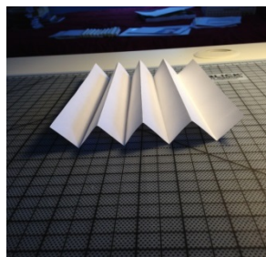
Mountain and Valley